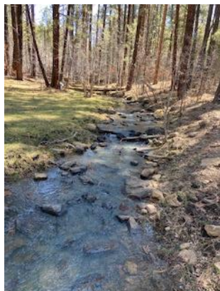
Chicken Creek Ski Area