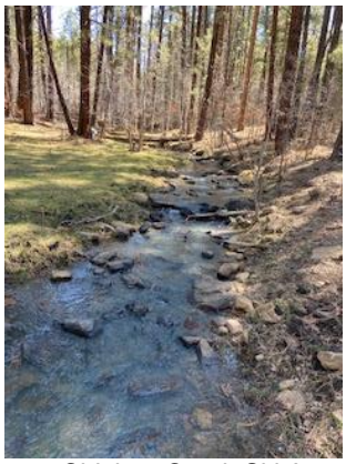
Chicken Creek Ski Area