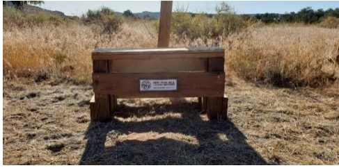
MVBCH Great Mounting Block at Sand Canyon

KEEP AN EYE ON THE NEW AND IMPROVED WEB SITE!