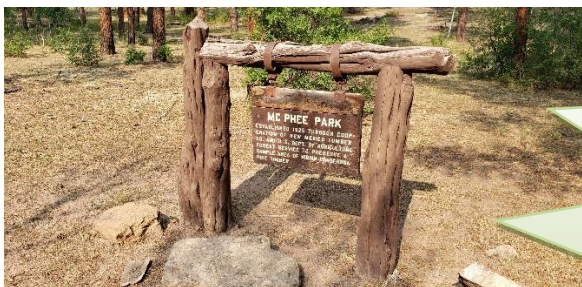
McPhee Park Sign – McPhee Park

KEEP AN EYE ON THE NEW AND IMPROVED WEB SITE!