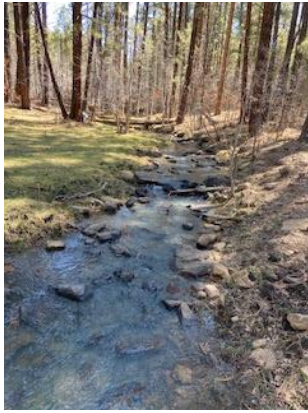
Chicken Creek Ski Area